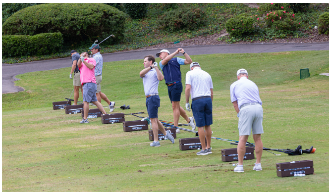
Tournament participants practiced their swings and putts prior to the day of golf