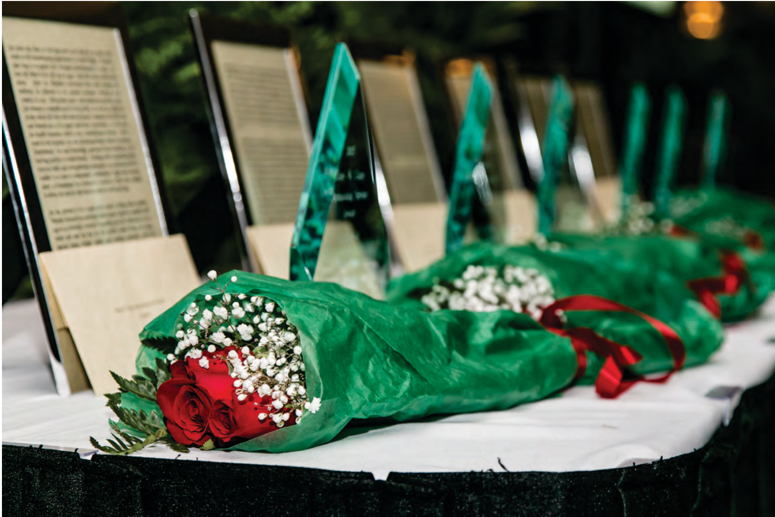
2018 Award Winners

District I, II, III, IV & V Nurse Aide of the Year Riley W. Clapp Outstanding Service Award