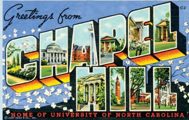
Chapel Hill Without UNC – ECHO – East Chapel Hill Observer

The population of 57,233 is diverse, consisting of University faculty and staff, students, business people, and retirees from all over the world, not to mention the native Chapel Hillians. The Town's transformation from a small, relatively rural, turn-of-the-century village to a thriving, cosmopolitan University city has occurred since 1940, largely in concert with corresponding growth and change in the University. In response to the demands of the rapidly growing population, Town government has undergone a thrust toward modern business professionalism to meet the higher levels of service needed.