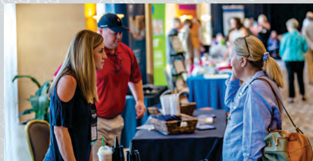
Exhibit Partner Showcase